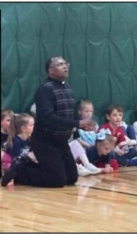
Catholic Schools Week 2025