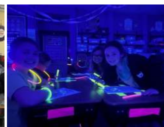
Students in second grade enjoyed special themed educational activities as they rotated classrooms to experience a "Mad Scientist" experiment, football lessons and glow activities.